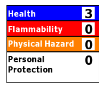
HMIS RATINGS (0-4)