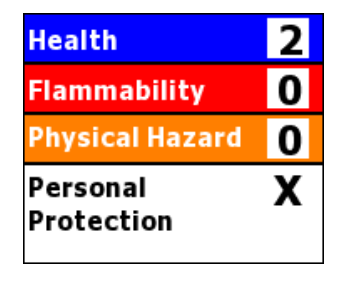
HMIS RATINGS (0-4)